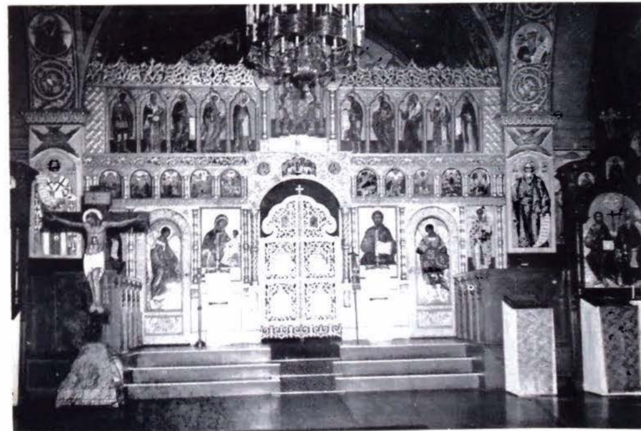
Icon-screen of the main church, hand-carved by the monks.

As night descends and wraps the world in the oblivion of sleep, the monk in his cell, like a candle of offering before the altar, keeps watch over his heart. Monasticism, in the words of Bp. Theophan the Recluse, is a sacrifice offered to God from the world and for the world.