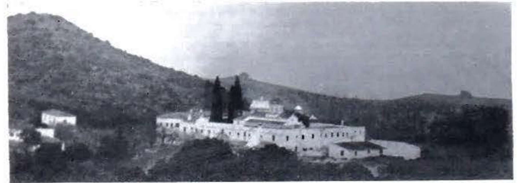
Aegina: The Convent of the Holy Trinity, established by St. Nectarios, as it appears today