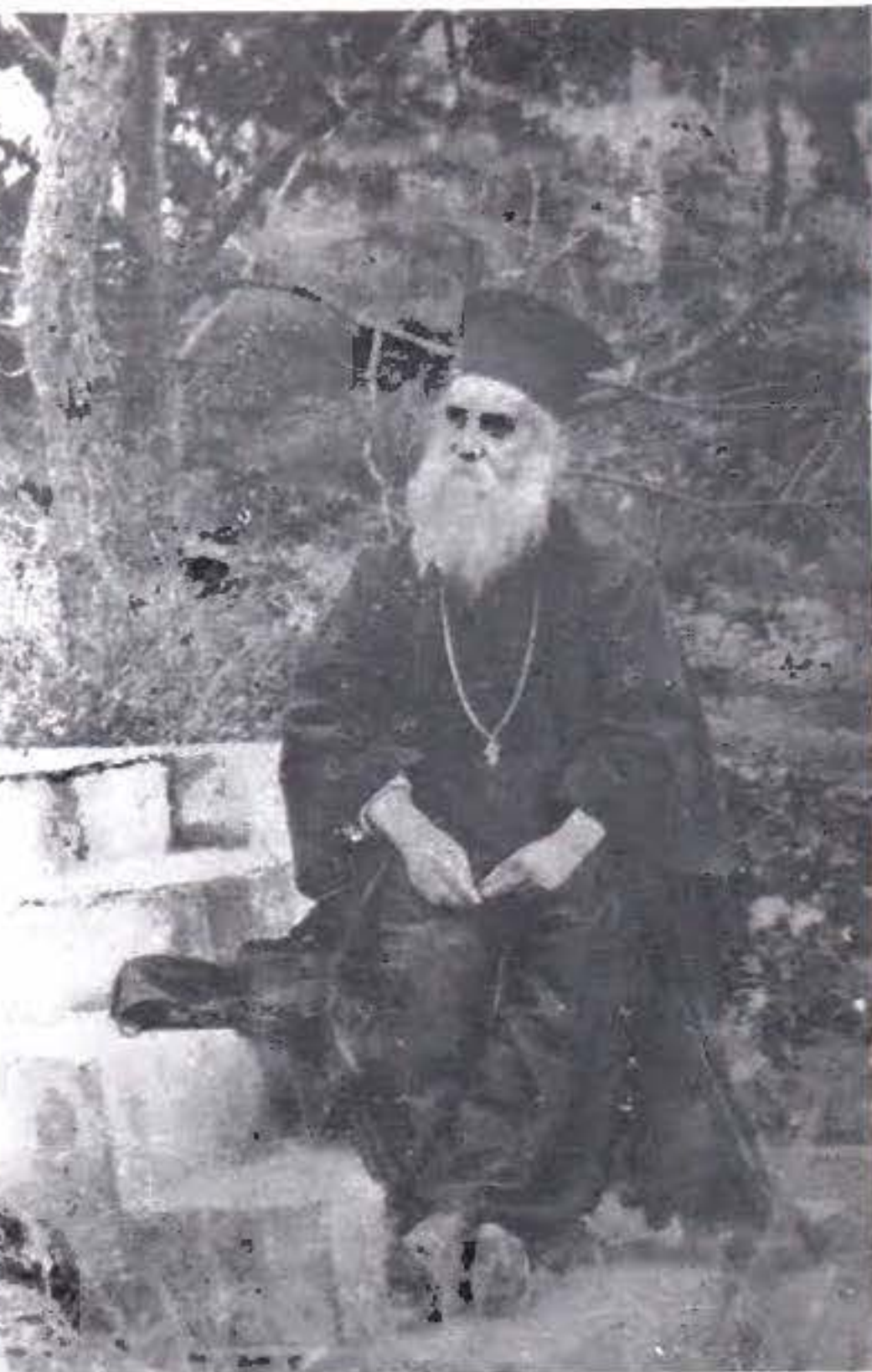
St. Nectarios when director of the Rizarios School