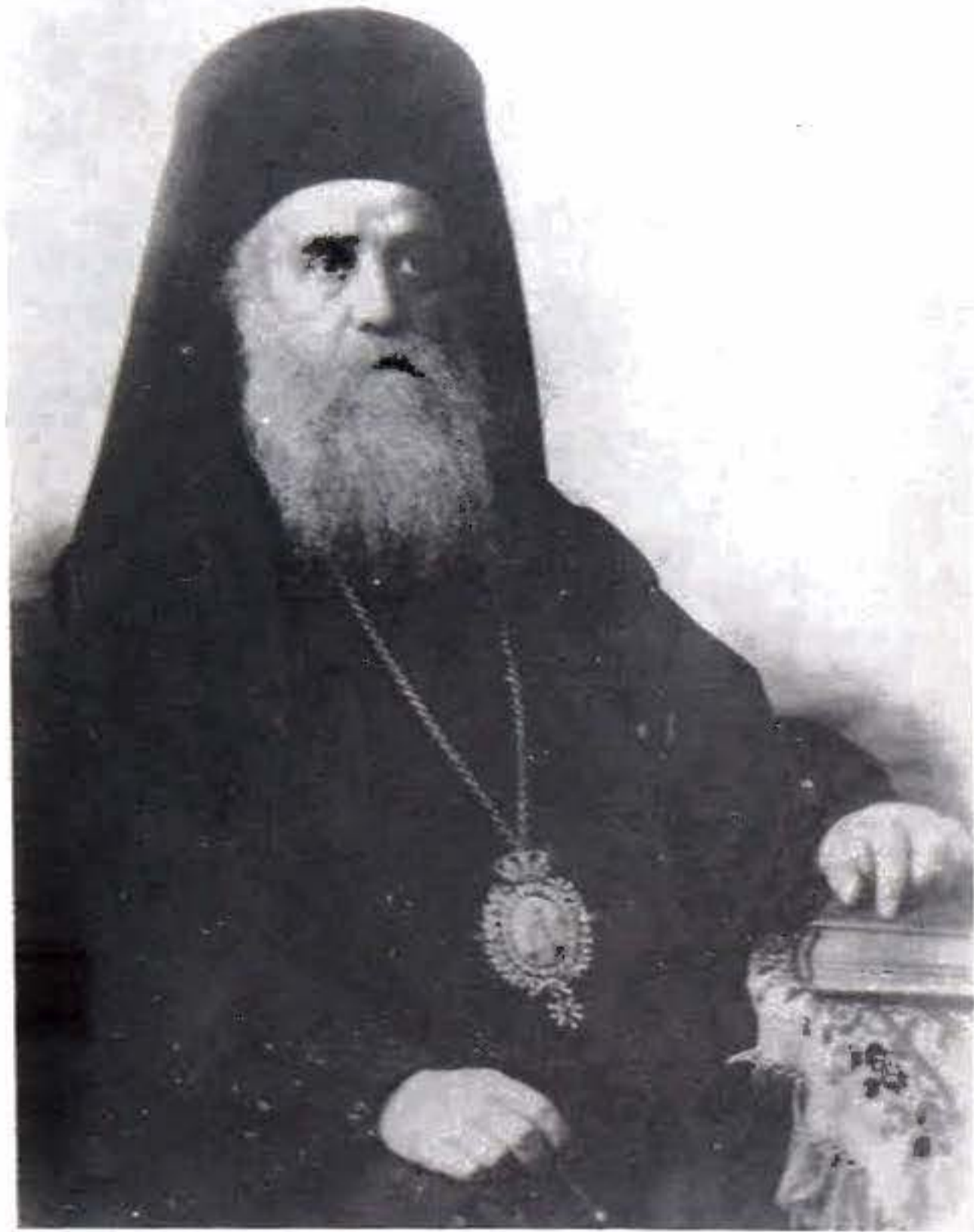
ST. NECTARIOS KEPHALAS