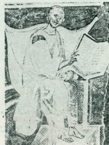
The earliest surviving icon of Blessed Augustine (6th-century fresco in the Lateran Library, Rome)