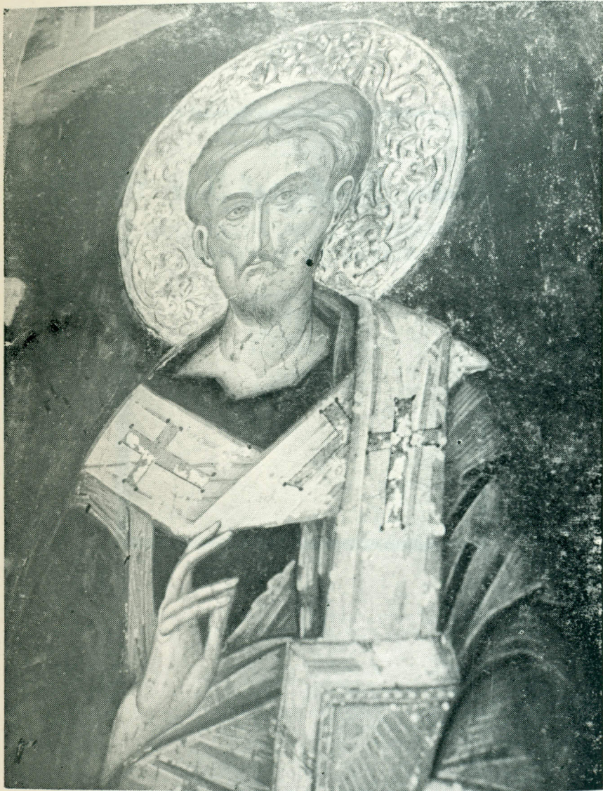
Blessed Augustine, fresco of Meteora Monastery of Varlaam