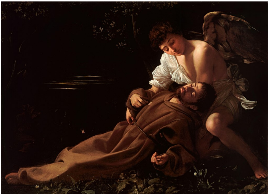
Saint Francis of Assisi in Ecstasy by Michelangelo Merisi da Caravaggio

some of these pictures that are all sort different themes. Even one here by Caravaggio, it's quite early, a little later, 1600. He has a picture of the ecstasy of Francis, which is very interesting. It fits in with all that... (sound fades)