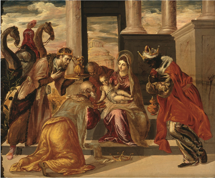
Adoration of the Magi by El Greco

Student: Are those supposed to be Mary and Christ?