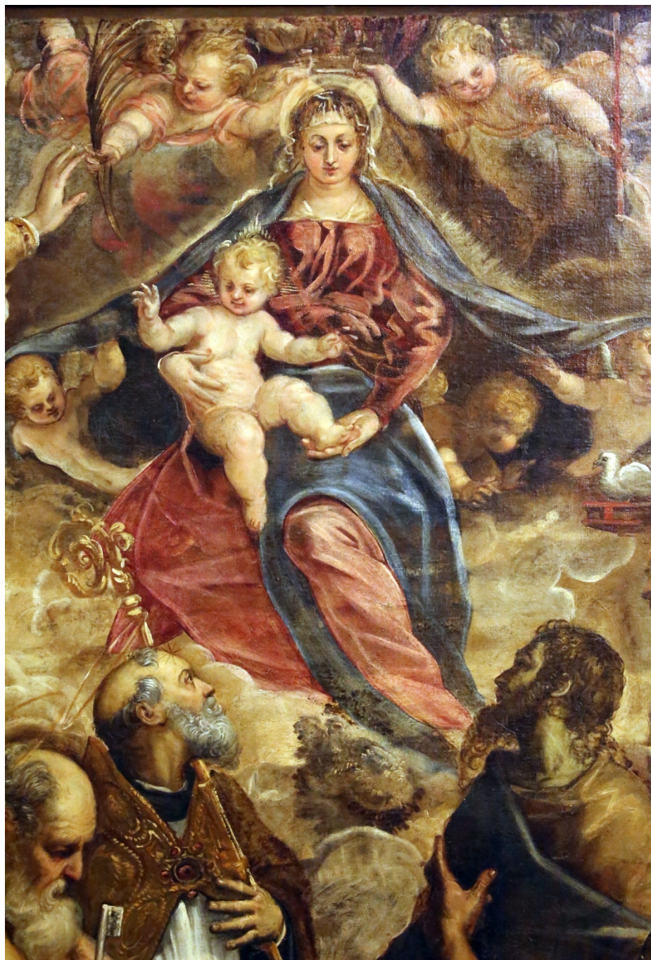
Madonna and Child by Tintoretto