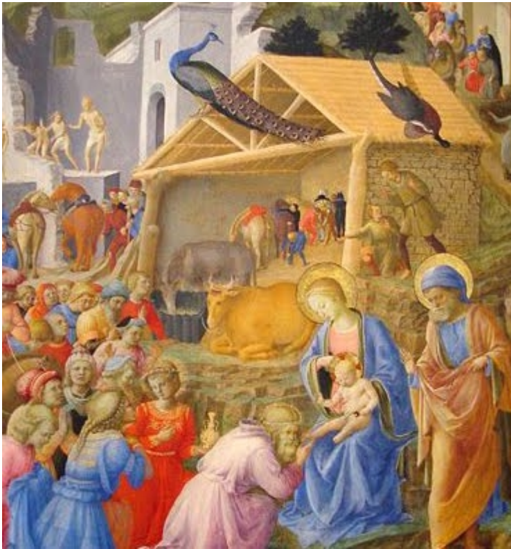
The Adoration of the Magi by Fra Angelico and Fra Filippo Lippi