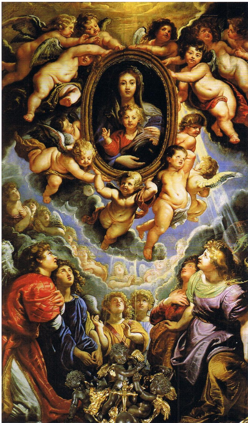
La Madonna della Vallicella by Peter Paul Rubens