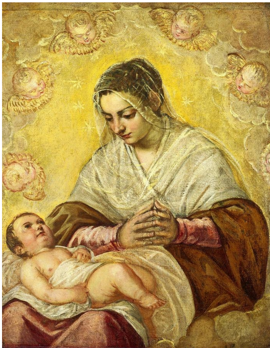
The Madonna of the Stars by Tintoretto