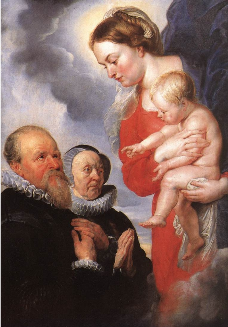
Virgin and Child by Peter Paul Rubens

The art of this period which is, of course, some of the great art of Western man, reveals – some things we won't go into: the resurrection of antiquity, the endless naked statues and all that, which are obviously a resurrection of the paganism of the body and this world. We'll look at a few of the religious paintings.