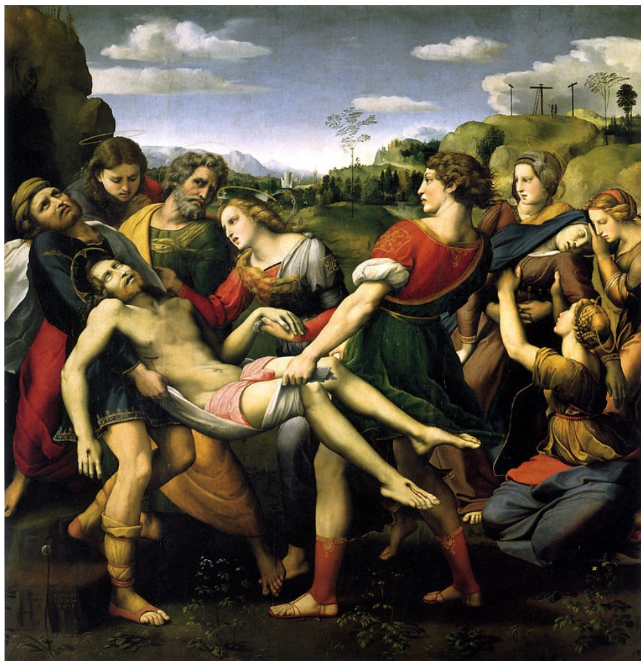
Deposition of Christ by Raphael

These are, from the Orthodox point of view, blasphemy. We know that for many of the painters, they had a very loose life.