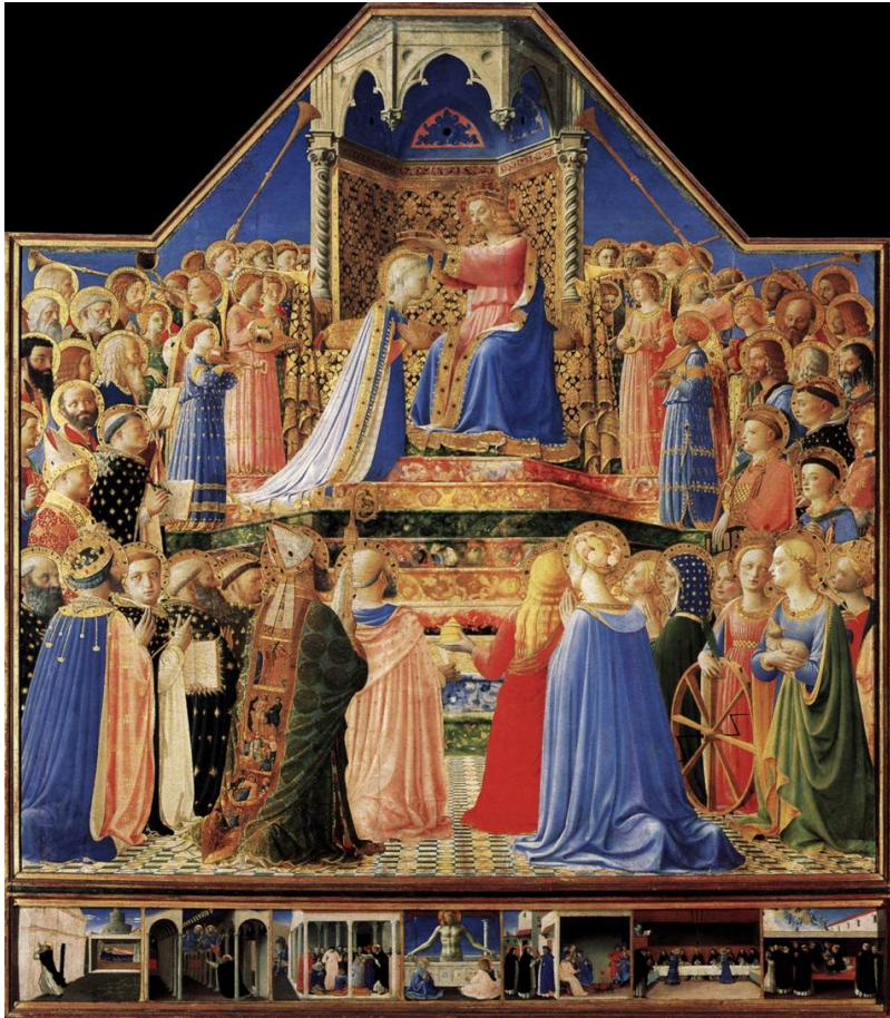
The Coronation of the Virgin by Fra Angelico

And there's another one here. It shows the Crucifixion already now some kind of realism, the emphasis all on the symbolic. The icon, there's nothing recognizable as an icon; it's totally worldly. And those that are the religious are in prelest.