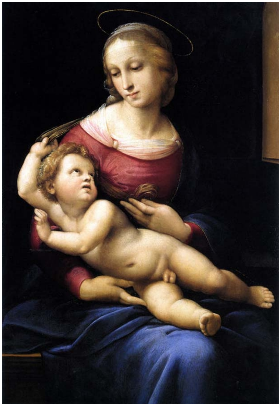
Madonna and Child by Raphael